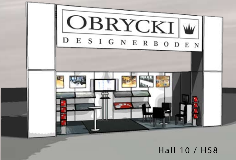
Hall 10 / H58